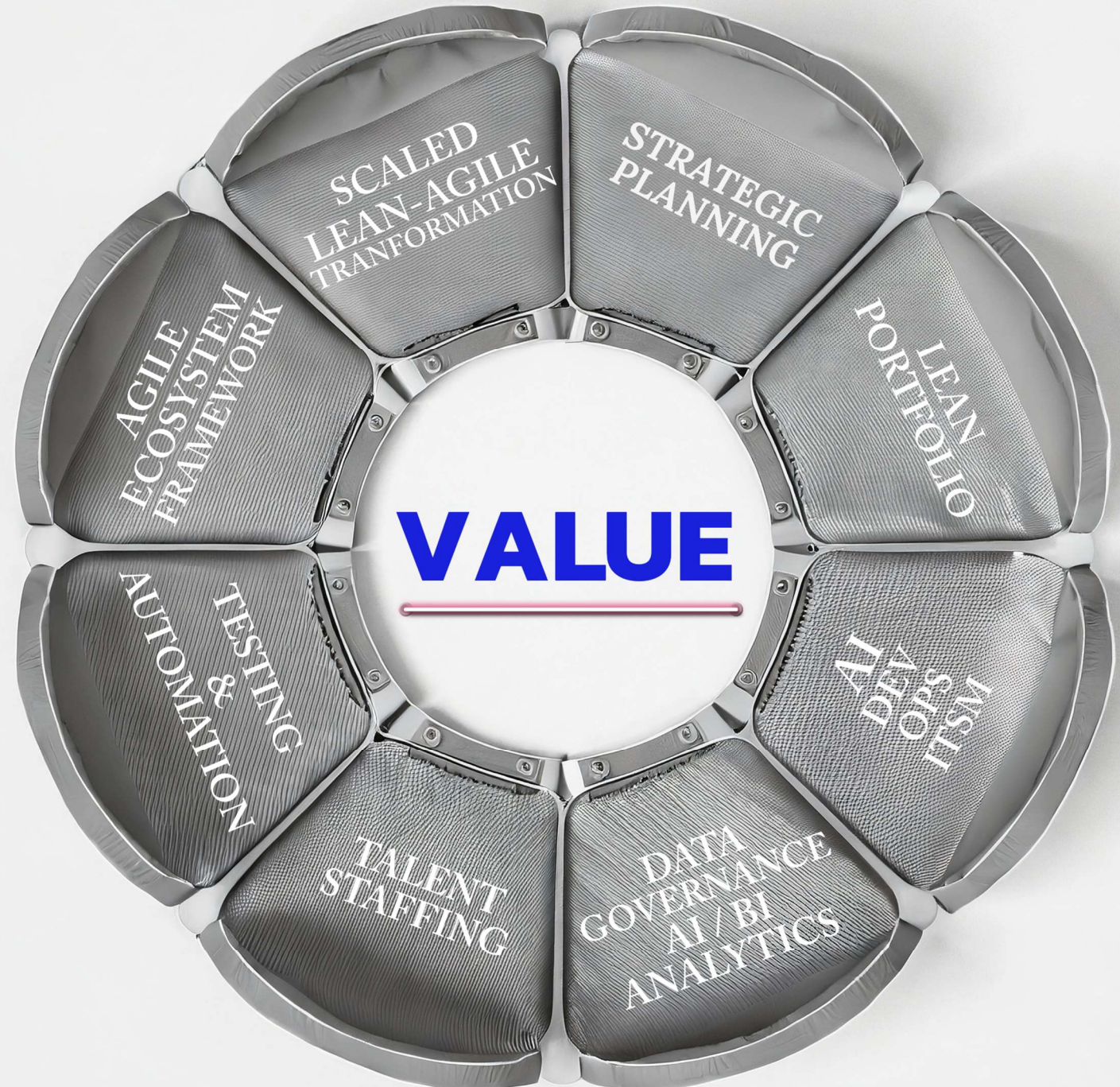
VTPMO Prime Components to Digital Transformation

Is your organization looking for more efficient way of working?